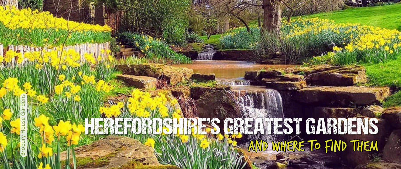
Brobury House Gardens